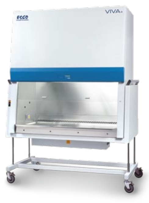
Viva® Universal Animal Containment Workstation, Model VA2-4A_.

The Viva Universal Workstation has been specifically designed to protect laboratory personnel from airborne contaminants during cage changing and other procedures, to protect the environment from particulate emissions, and to protect laboratory animals from external and cross-contamination. Personnel involved in the care and use of research animals work in an environment that presents a number of unique hazards from many sources. With the introduction of the Viva Animal Containment line of quality products Esco applies decades of experience in clean air technologies to the animal research laboratory.